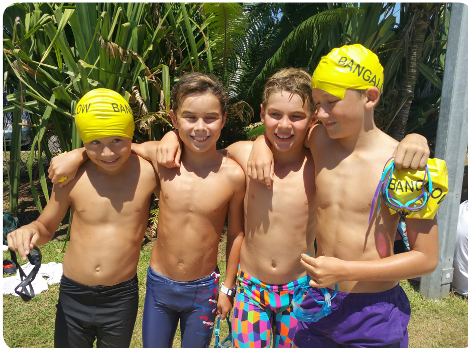
Boys 8-10yrs 200m Freestyle Relay Team "The Awesome Foursome!"